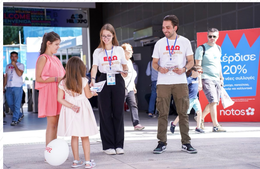
Distribution of Promotional Material