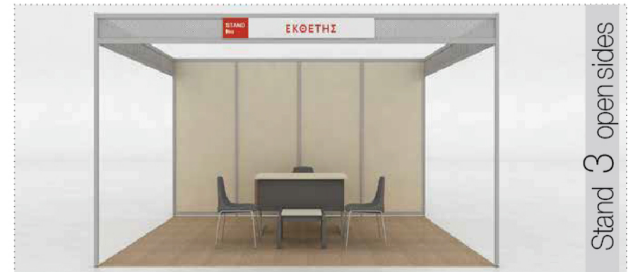
Stand 3 open sides