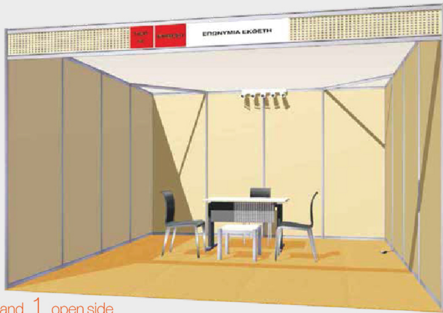
Stand 1 open side