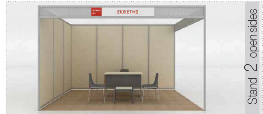
Stand 2 open sides